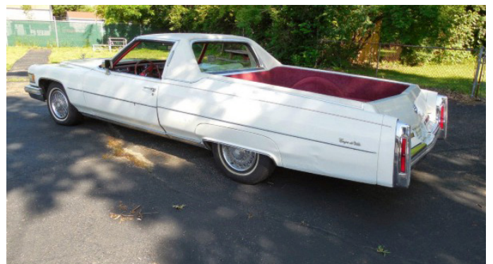
Cadillac De Villamino