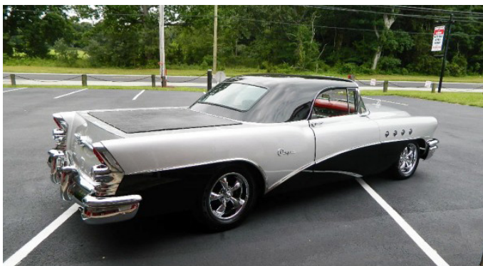
Buick El Roadmonster