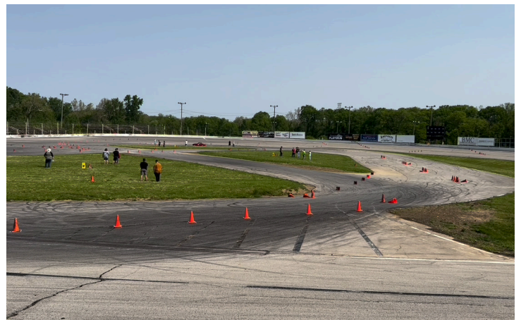
An earlier photo from Kil-Kare Raceway. A very nice track designed for autocross type racing. Looks like an exciting time is ahead of us this summer.