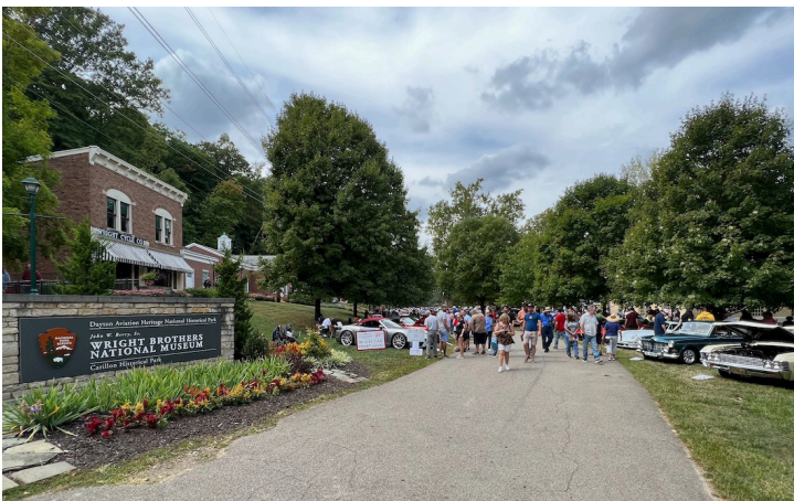
Another earlier photo with the show cars at Dayton Concours D' Elegance at Carillon Park. The Wright Brothers National Museum is the building on the left.