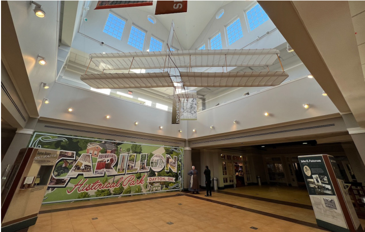
The lobby area at Carillon Historical Park. A gift shop just right of billboard. Door at far right is one part of indoor museum and from front door entry way.