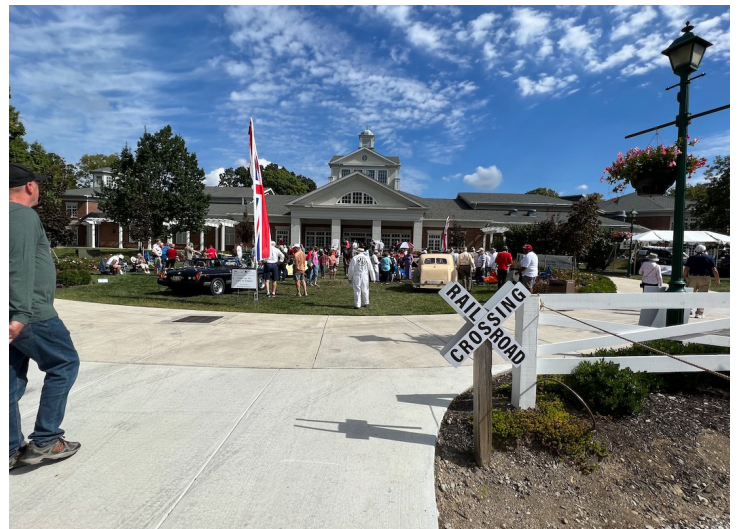
An earlier photo taken last September during the Dayton Concours D' Elegance. The show cars are parked on a circular lawn in front of the entrance way (or exit from the museum).