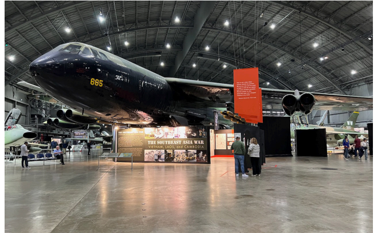
A view from inside hanger #2 at the USAF Museum. This is the area where dinner is served for the dinner tour.