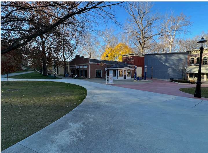
Park ground outdoor area at Carillon Park. This area is ideal for Concours with parking on grass and possible photo shoot next to the Sunoco station.