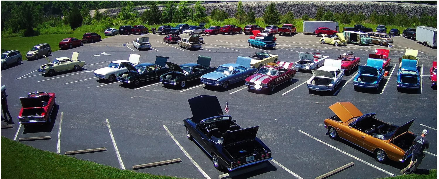
An aerial view from a drone overlooking the parking lot.

The club celebrated its 50th anniversary at the Mid Ohio Meet held at Caesar Creek State Park. We had a very good turnout on a very nice weather day with the temperature in the seventies. Sandwiched between two stretch of heat waves with tempatures in the mid nineties, who could have asked for a better day? The new location with the two shelters worked out very well allowing plenty of room for the large selection of door prizes in one shelter and the other for food and eating. The 88 hamburgers and 50 hot dogs were all eaten. Of course there was plenty of side dishes and desserts so no one went away hungry. Larry and Willa Smith were there so we had Willa say the prayer before lunch. Since Jerry Fritts is no longer an active member Willa has been our go to person for this.