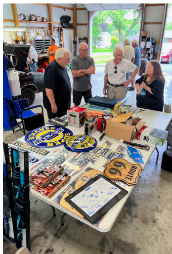
Gearing up... Sorting the door prizes at the Corvair shop.

The previous Sunday organizing effort by a number of club members helped the cause as the large number of door prizes required planning for distribution and identification to make the giveaway run smoothly. Fifty registration packets also were assembled in an assembly line. Decisions were made on how much hotdogs and hamburgers