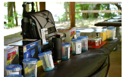
Grand prizes... Ladies getting the grand prizes ready at day of show.

With the entire parking lot to ourselves, we had the Corvairs grouped by classes to make it easier to judge the top cars in each class. That worked very well. Two came with their car trailers and parking for them with other "non-Corvairs" along the outer edge of the parking area kept them separate from the Corvairs. The restrooms though were a little far away for those who don't like to walk but they could have gotten a motorcycle 3-wheeler ride or a ride on a golf cart to the restrooms.