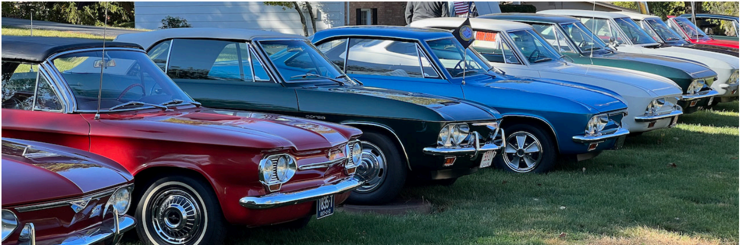
MEMORY LANE...Thirteen Corvairs were on display on the front lawn at the Vair Affair. Story on page 3.