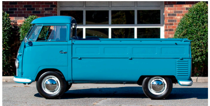
Volkswagen Type 2 (Transporter)