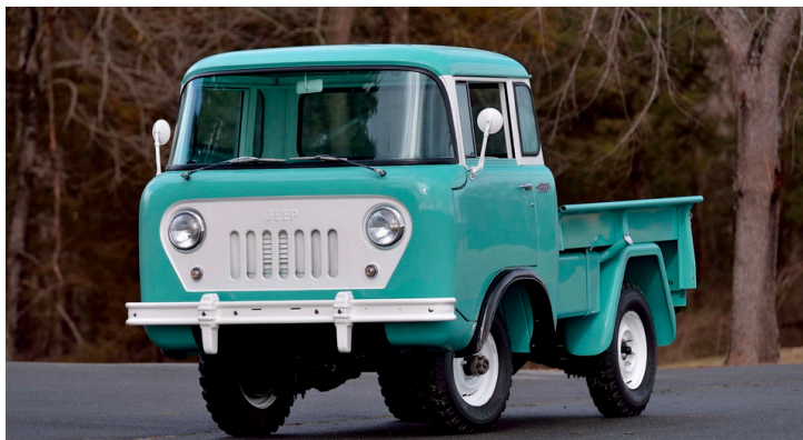
Jeep Forward Control