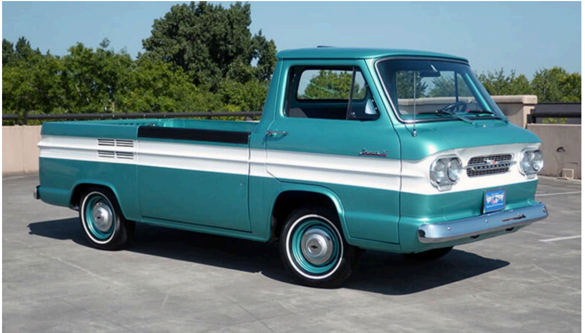
Chevrolet Corvaair Rampside

Hagerty recently published their rankings on a group of 1960s FC trucks. The decade that brought the forward control to market in several different shapes and forms. They may never pass the safety standard we have today. We can only go back and admire them as they were. When it comes to fun, form and function between a Dodge, Volkswagen, Jeep and Ford, nothing beats the ride like the Corvaair. Take a look and read what Hagerty has to say about them. The Corvaair Rampside tops the list. https://www.hagerty.com/media/entertainment/forward-control-trucks-of-the-1960s-ranked/?utm_source=SFMC&utm_medium=email&utm_content=20_May_19_Newsletter_NewDD