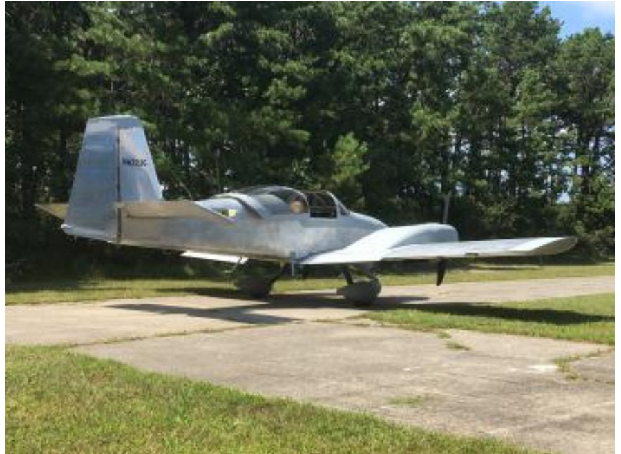
TwinJAG, a two seater all aluminum plane is powered by two 125hp modified Corvair engines.

Our October activity is a tech session at Gary Funkhouser's shop on Sheehan Rd. on the south edge of Centerville. The date is Saturday October 13th. Plan to be there at 10 AM. The address is 9452 Sheehan Rd. The shop is in the big building at the rear of the property. The driveway is on the left side of the house. Park back by the building.