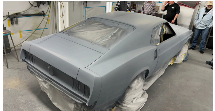
A 1969 Mach 1? Nope, a 2023 with all new body ready for painting.