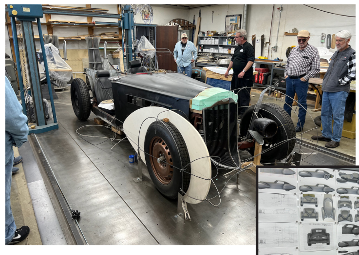
A custom Palma Packard in the metal work building. Will we see its completion next year?