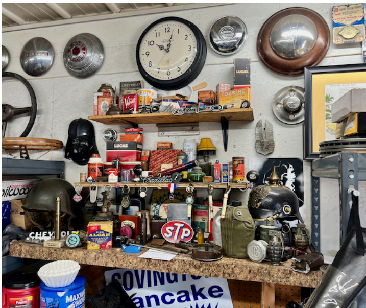
A collection of old time memorabilia in the first workshop at D&D Classic Restoration.